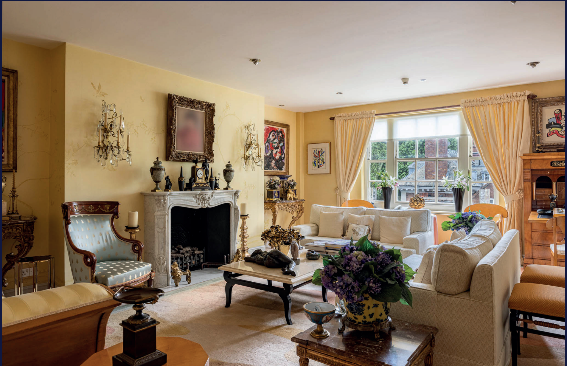
Melbury Court, W8