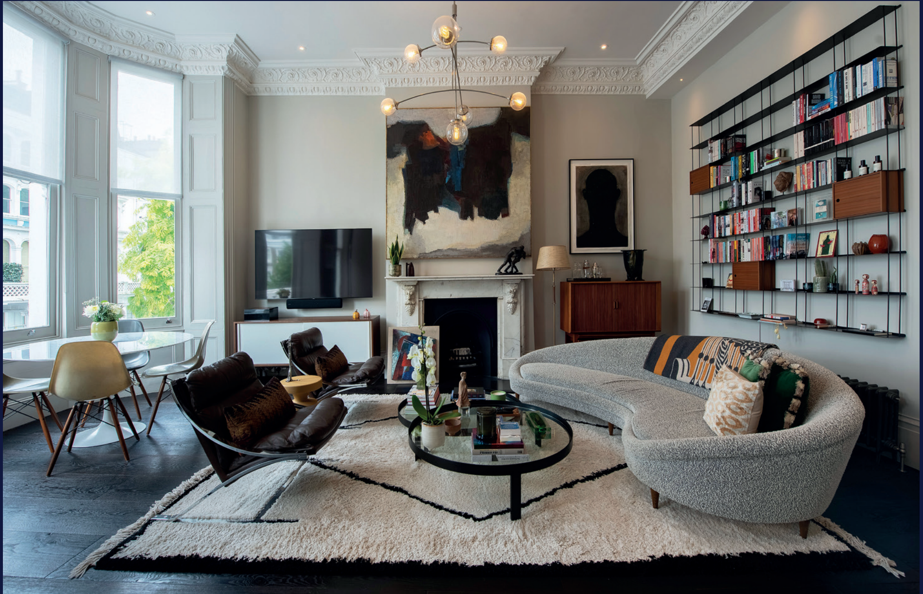
Colville Terrace, W11