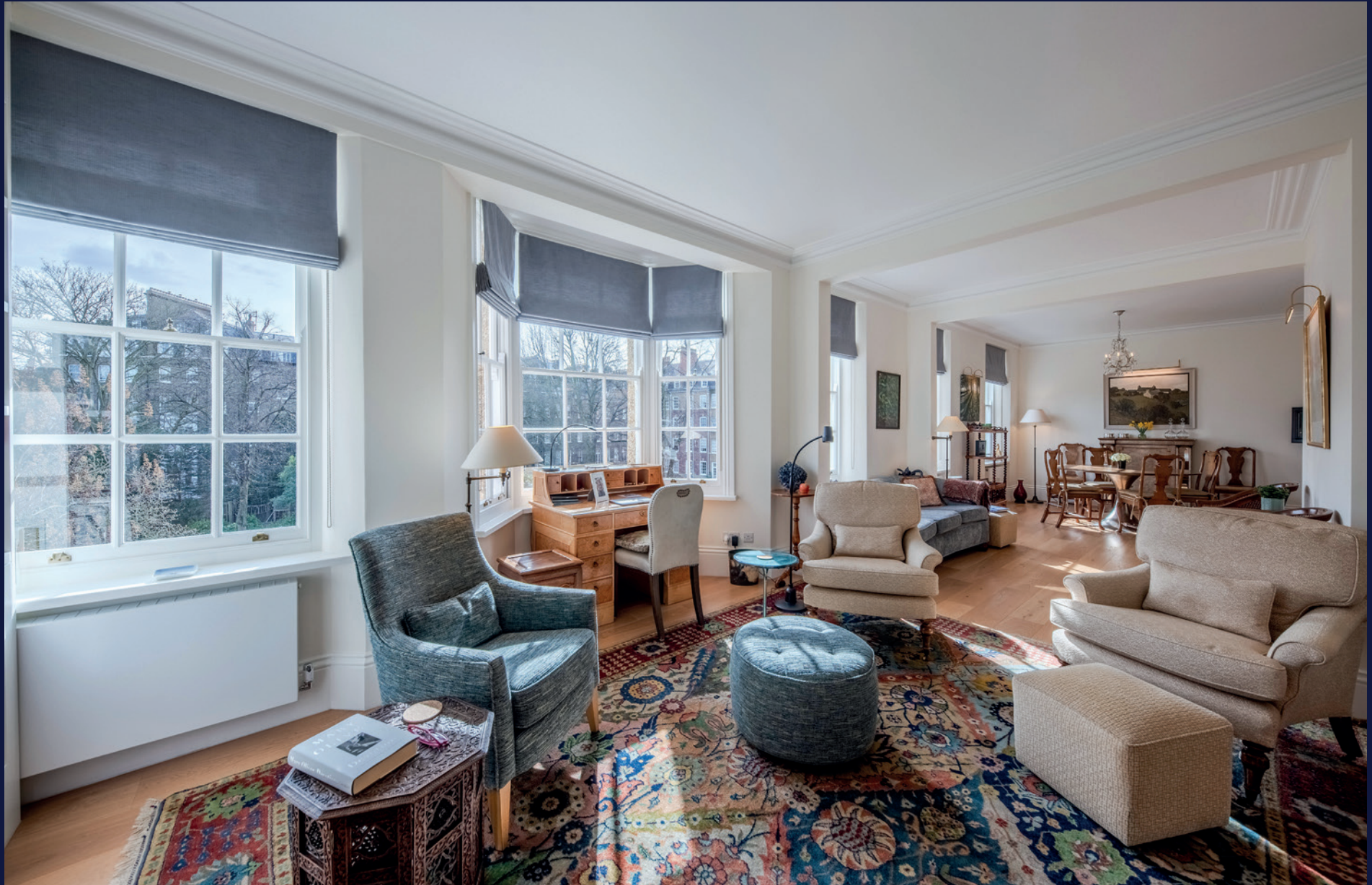
Coleherne Court, SW5